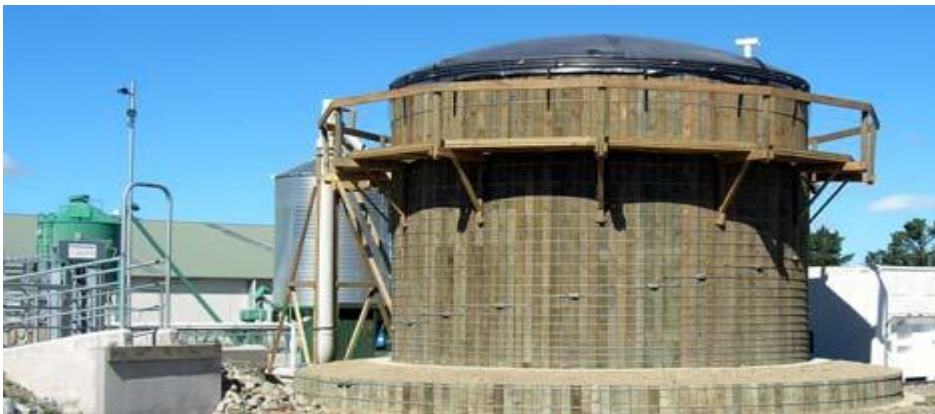
An AD digester in Canterbury uses dairy waste

Other drivers are utilisation of a free energy source, minimization of pollution risk, effective management of the wastes, and production of digestate as a nutrient resource. It is estimated that annually rural New Zealand produces several million tDM of livestock manures per year, but less than 600,000 tDM is contained in feeding or milking areas where it could be utilized to produce biogas. Further, crop wastes are estimated to total 500,000 tonnes per annum of material that could yield much more biogas per tonne than manure. Co-digestion of manure with crop residues would improve the economics of digester investment.