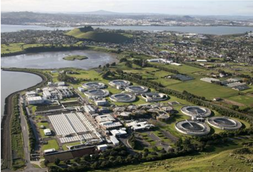
Mangere Wastewater Treatment Plant