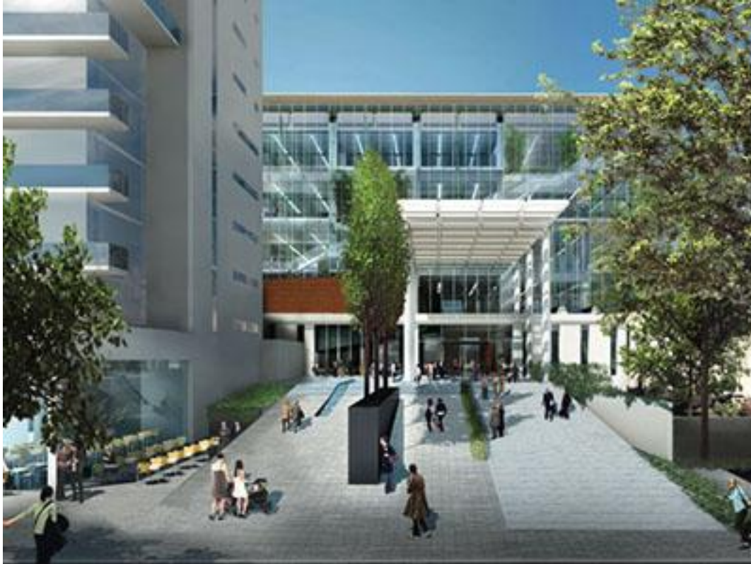
Figure 4. Artist's impression of Christchurch trigeneration plant building

This kind of innovation could be mirrored in a number of cities across New Zealand.