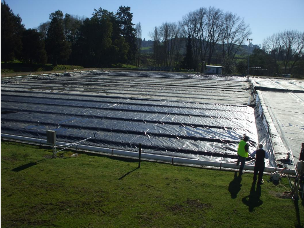
Tirau biogas reactor for dairy wastewater