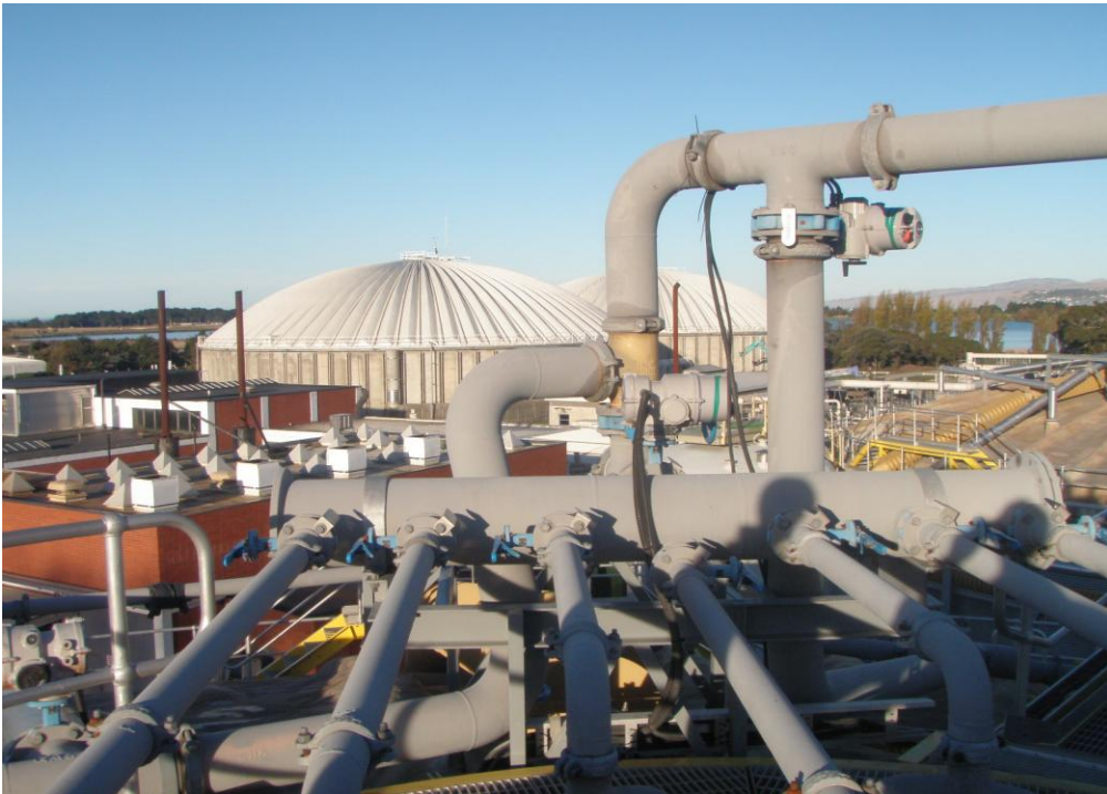
Wastewater treatment in Christchurch