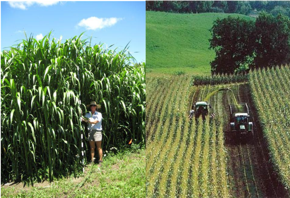
Sorghum and maize crops for energy production

In the long-term, this biogas source has the greatest potential for the gas production. It will be driven by the availability of domestic natural gas, international prices for fossil fuels, the economic cost of greenhouse gas emissions and government incentives addressing national energy security, rural development and land management. Biogas cropping in good farming areas such as the Waikato could yield over 300 GJ/ha/annum and only moderately less in some marginal sites with the right crops and adequate rainfall. It could be a valuable tool to partially mitigate problems associated with current farming practices such as nutrient leaching and run-off, water abstraction conflicts and odour and GHG emissions.