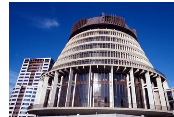
Government & local govt