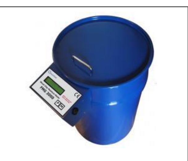
Exoek FMG 3000 moisture meter bin

The Exotek FMG3000 Moisture Meter - is a robust and simple-to-use bucket meter for quickly determining the moisture content of wood chip.