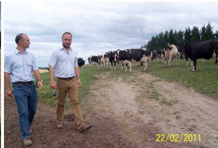
Capped area of treated landfill