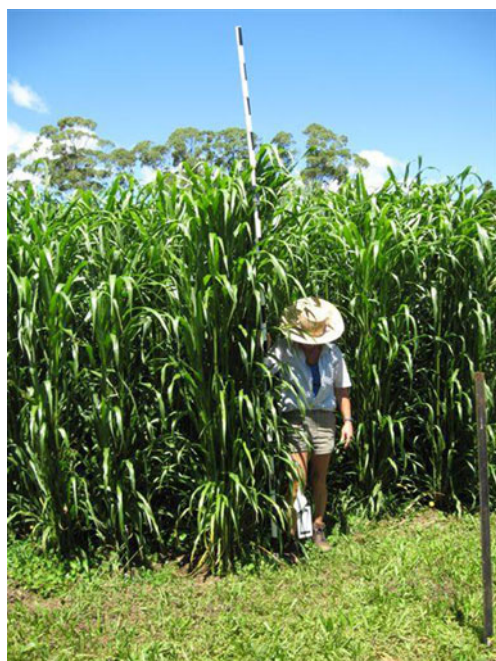
Fig. 8 Pearl millet ( Pennisetum glaucum ). The cultivar 'Nutrifeed' yielded 31.2 \text{ t DM ha}^{-1} 2 months after the photo, similar to subtropical sorghum yields in Northland

Primary Industries and Fisheries 2005). Cultivars for feed seed production are short in both height and season, so forage cultivars are preferable for biomass. The potential for pearl millet to have a high yield in northern New Zealand is based on its height and growth similarities to sorghum in Australia (Pacific Seeds 2009) and on high sorghum yields in past New Zealand trials (Piggot and Farrell 1984). In the authors' 2010 trial in Northland, the yield was very high, 31.2 \text{ t DM ha}^{-1} (Fig. 8; Kerckhoffs et al. 2011).