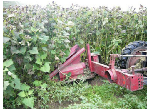
Fig. 4 Yacon ( S. sonchifolius ). Yacon is grown for its crisp edible root and also has massive shoot growth (but which is quite reduced by root harvest time). Notice there is frost burn of the upper leaves

Agronomy New Zealand trials found that yacon requires early spring planting and a long season to achieve high root fresh mass yields; in cooler areas, the root yield was only 20–30 % of the top yield in a warm site (Douglas et al. 2007). Therefore, only latitudes below 38^\circ should be