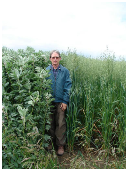
Fig. 9 Tickbean or broadbean ( V. faba ). These plots yielded >20 t DM ha -1 in 2011 due to a warmer than average Hawke's Bay winter

Criteria match for dry mass yield Vicia faba (also called broad bean, fava bean) is a winter crop that has been reasonably well researched as a forage crop in New Zealand. The dry mass yields reported in the South Island experiments were always <15 t ha -1 (Jones et al. 1989; Newton and Hill 1987; Rengasamy and Reid 1993). A 2011 Hawke's Bay trial with the cultivar 'Wizard' sown on 11 April and harvested 28 October yielded an impressive 24 t DM ha -1 (Fig. 9; data not yet published).