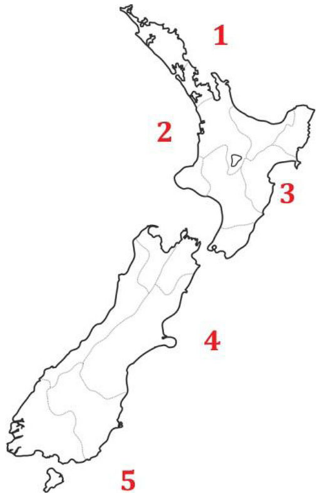
Fig. 1 New Zealand map for referencing discussion of the yield performance of species in various regions. The numbering key for regions discussed in the review is: 1 Northland, 2 Waikato, 3 Hawke's Bay, 4 Canterbury, 5 Southland

The following subsections list species (categorised by crop growth habit) with literature review findings for each that provide (1) a brief description of their potential as biomass crops based on yield, (2) relevant aspects of each species' agronomy and (3) whether there are issues making it less favourable to use as a crop in New Zealand. Since some of the species information from New Zealand is specific to the geographic regions of the country, Fig. 1