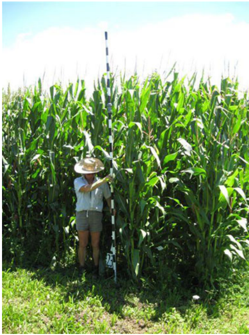
Fig. 5 Maize ( Z. mays ). Selection '33M54' is a long-season type and yielded 33.7 t DM ha -1 2 months after this photo in Northland

personal communication). Maize response to nitrogen supply has been characterised in the New Zealand crop model AmaizeN (Li et al. 2006), and the response to soil water supply has been widely studied (e.g. Sadras and Calvin 2001).