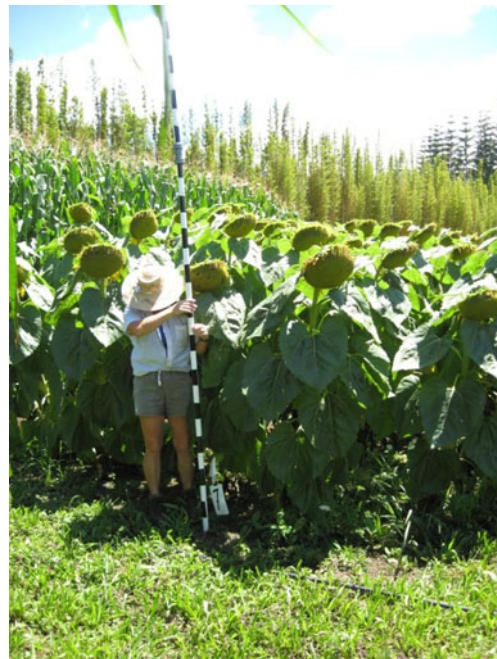
Fig. 6 Sunflower ( H. annuus ). Forage sunflower has lower dry mass yield than other species tested and has about 25 % of its dry mass as seeds, which can be lost to birds

Agronomy Sunflower has potential as a biomass species due to its moderate dry mass yield in mildly marginal conditions and a relatively short growing season. Since the aim of biomass production is to maximise sustainable yield on a year-round basis, a species with a fast growth rate that fits between other crops can satisfy a useful purpose. The irrigation response by sunflower has been studied in the Mediterranean (Goksoy et al. 2004; Sadras and Calvin 2001) and Australia (Connor et al. 1985). Another high dry mass factor is the effect of canopy architecture (Archontoulis 2011). Both of these factors are less optimal in sunflower than in very high dry mass species such as cardoon and kenaf (Archontoulis 2011).