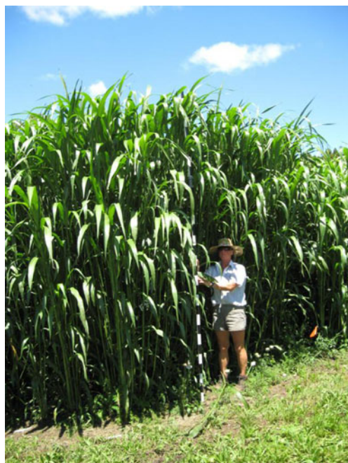
Fig. 7 Sorghum ( S. bicolor ). In Northland, the subtropical sorghum × sudan hybrid ‘Jumbo’ had a 30.3\text{-t DM ha}^{-1} yield 2 months after the photo

Criteria match for dry mass yield The dry mass yield of fibre sorghum in the north of Italy was 26.2 \text{ t ha}^{-1} (Amaducci et al. 2000). High yields were also observed in Greece (Danalatos et al. 2009). The cooler New Zealand climate might be expected to limit yields, and that has been the case based on the average yield of 15.5 \text{ t DM ha}^{-1} from several New Zealand science reports (Cottier 1973; Taylor et al. 1974; Chu and Tillman 1976; Rhodes 1977; Piggot and Farrell 1980, 1984; Causley 1990). However, the mean would be much lower without the results in the reports by Piggot and Farrell (1980) and Piggot and Farrell (1984) who found that ‘Sugar Drip’ sweet sorghum averaged 25 \text{ t DM ha}^{-1} in deep loams and well-drained fertile clays and 20 \text{ t DM ha}^{-1} in dry friable soils in Northland, the warmest part of New Zealand. The best subtropical sorghum cultivar yield in a 2010 Northland trial was 30.3 \text{ t DM ha}^{-1} (Fig. 7; Kerckhoffs et al. 2011).