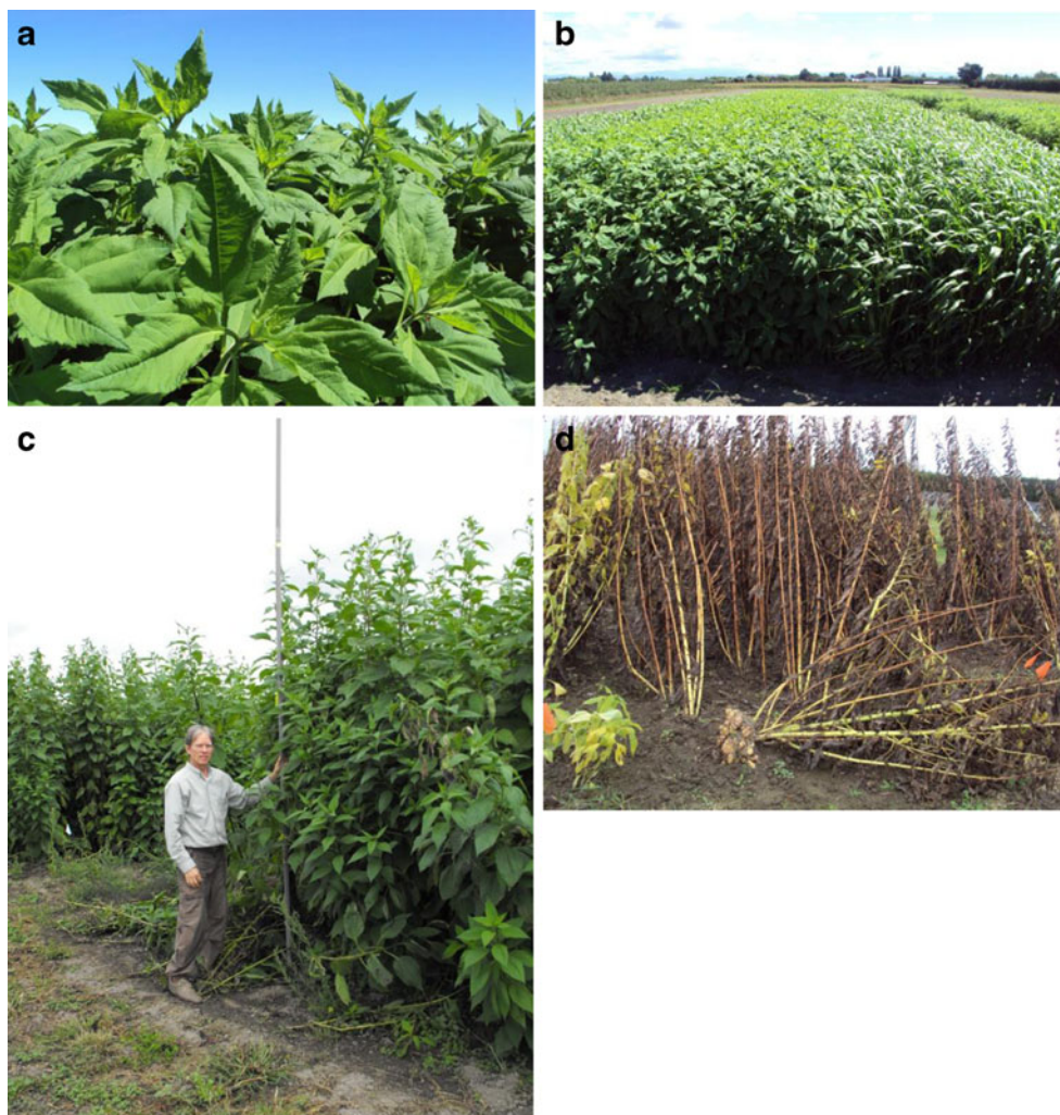
Fig. 3 Jerusalem artichoke ( H. tuberosus ). Vegetative growth is rampant even in cool weather (a) and in Hawke's Bay region is similar to the growth and mid-summer mass of the sorghum on either side (b). Shoot dry mass peaks after flowering (c) and shoot mass is translocated to the tubers from the stage in (c) through to shoot senescence (d)