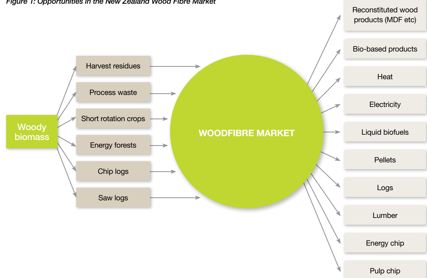
Figure 1: Opportunities in the New Zealand Wood Fibre Market

The use of wastes and effluents, while small in energy potential, offers significant opportunities for reducing waste volume and green house gas emissions as well as improving quality of waste water discharge.